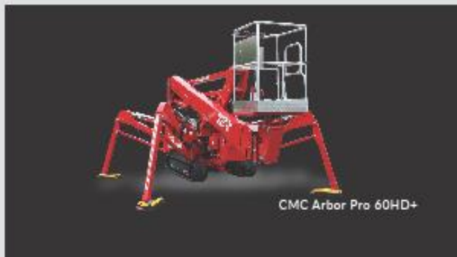
CMC Arbor Pro 60HD+